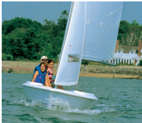
Versatile for the sailing family

Aft Mast Carrier Mainsail Cover Mast Float Motor Mount 2.5 HP Outboard Motor Seat Cushions Trailer - Galvanized Trailer Tongue Jack